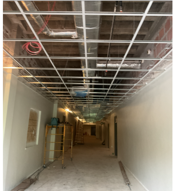
Continue with ceiling grid installation