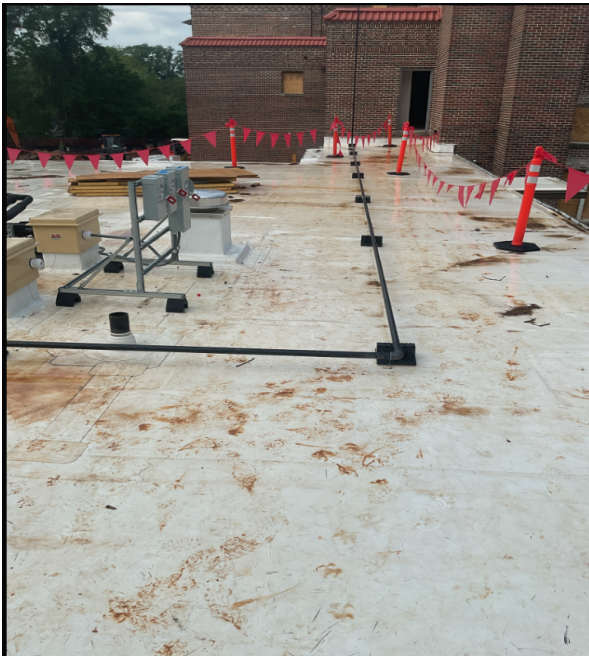
Continue with gas line install