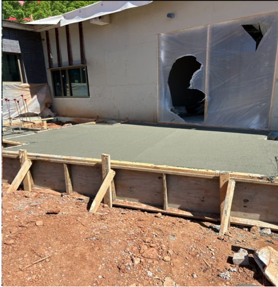
Security Vestibule pour back is complete